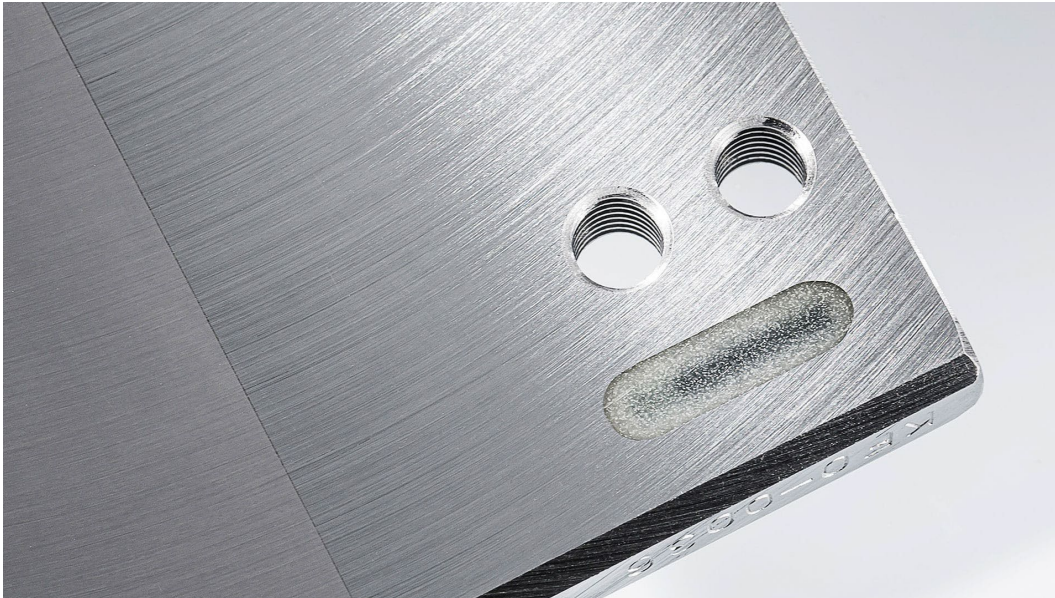
Small, but important: The RFID-Chip is the centerpiece of IntelliKnife