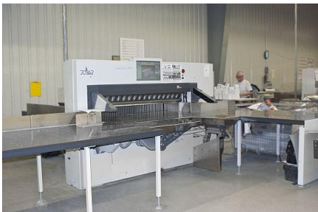
New POLAR N 176 PRO next to already existing POLAR 176 Xplus