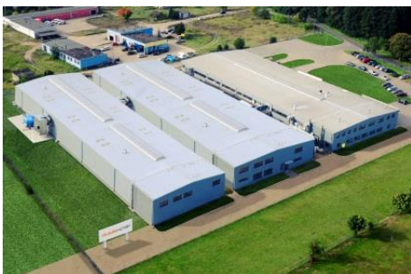
Corporate building of Colours Factory

Polish print house Colours Factory has improved its customer service by extending its cutting capacity thanks to new POLAR High-Speed Cutter N 176 PRO. The machine adds an already existing POLAR 176 Xplus.