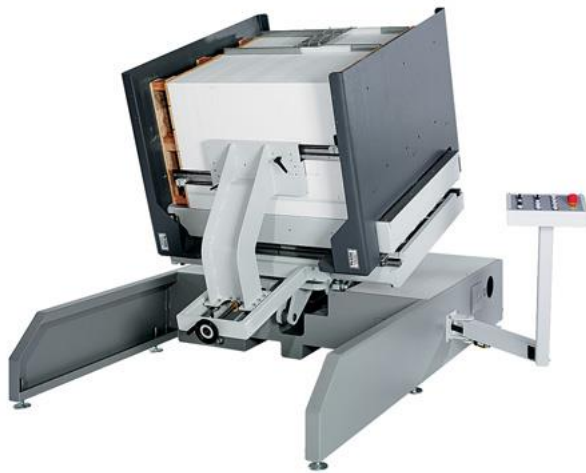
POLAR pile turner PW-4 ABV