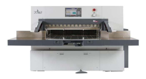
High-speed cutter POLAR N 137 PLUS