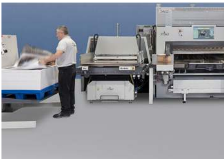
POLAR CuttingSystem PACE

POLAR's PACE CuttingSystems represent automated cutting. PACE is an abbreviation of POLAR Automation for Cutting Efficiency. With Autoturn turning gripper and Autotrim high-speed cutter as the centerpieces up to 5 cuts can be performed automatically. Meanwhile the operator can prepare the next cutting ream. This helps to enhance productivity and/or save personnel.