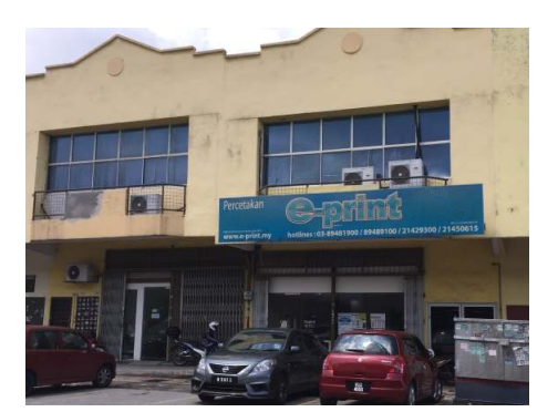
e-print print shop